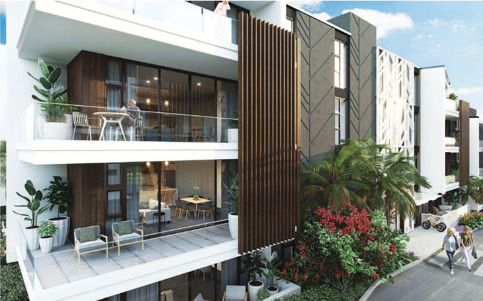
The apartments on offer include one-bedroom at 65sqm, two-bedroom and two-bedroom-plus-study ranging from 80-95sqm and three-bedroom at approximately 106sqm.