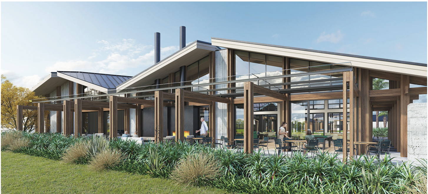
The Botanic offers a pool, cafe, restaurant, snooker, table tennis and both indoor and outdoor bowls.